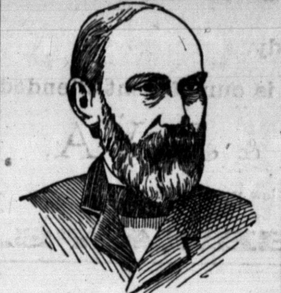
NELSON DINGLEY, JR.